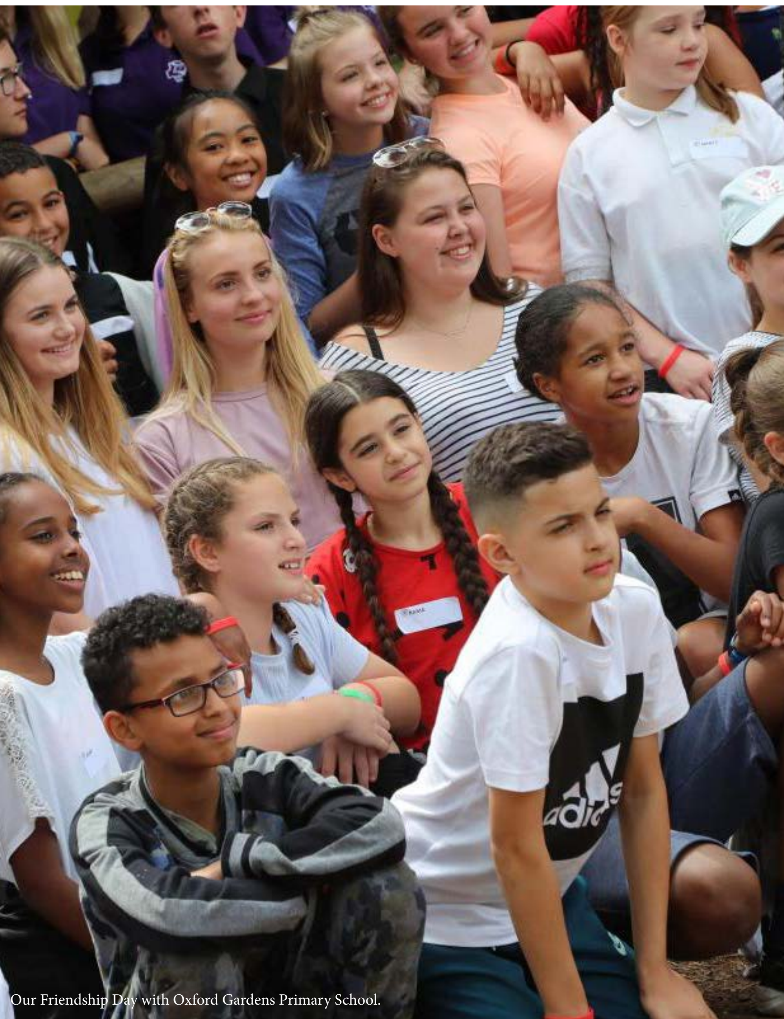
Our Friendship Day with Oxford Gardens Primary School.